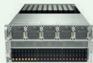
10 GPU Systems