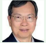
Charles Liang, President and CEO of Supermicro

"Now that AI is becoming pervasive, Supermicro continues to be committed to being the industry leader in creating the most performant and energy efficient systems from the data center to the edge. We aim to bring a world class infrastructure broadly available to organizations of all sizes for many large enterprises and super scale CSPs."