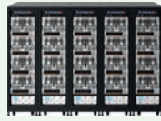
AI Rack Solutions