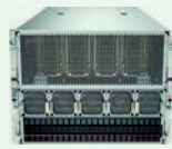
HGX H100 Systems