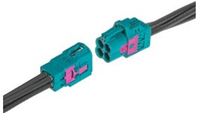
Standard FAKRA is being replaced by smaller, intercompatible and fully-shielded systems that deliver higher data speeds and allow more connections in vehicle architecture. Shown: Molex HFM

The use of Advanced Driver Assistance Systems (ADAS) has become more common recently. These systems are designed to augment the driver's skills to make the roads safer for all users. What began with a simple reversing camera has evolved into an integrated system that receives information from an array of sensors. This information is collected and processed in real time, allowing the car to identify potential hazards in the environment around it. From lane-departure sensors to traffic-sensing LIDAR (light detection and ranging), vehicles are able to take action to avoid accidents.