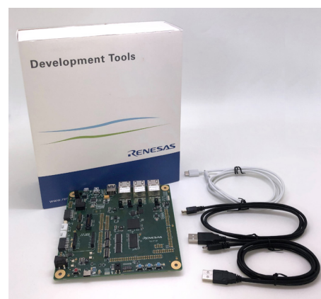
Renesas Starter Kit+ for RZ/N2L (P/N:RTK9RZ2L0S00000BE)