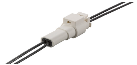
ValuSeal™ Mated Plug and Receptacle

Two circuit sizes will offer design flexibility