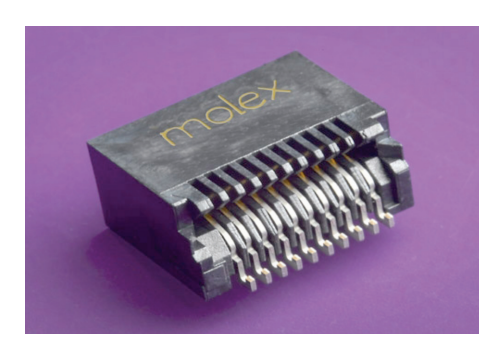
20-Circuit Connector, Series 74441