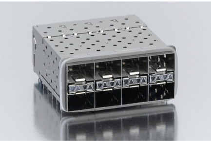
2-by-4 Connector with Elastomeric Gasket, Series 76092