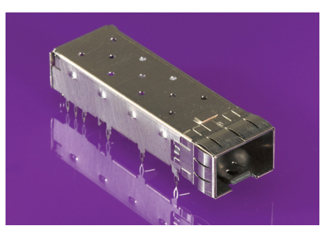
Single Cages, Series 74754