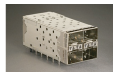
2-by-2 Connector with Metal Gasket, Series 76045