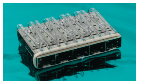
Ganged Cages, Series 74754