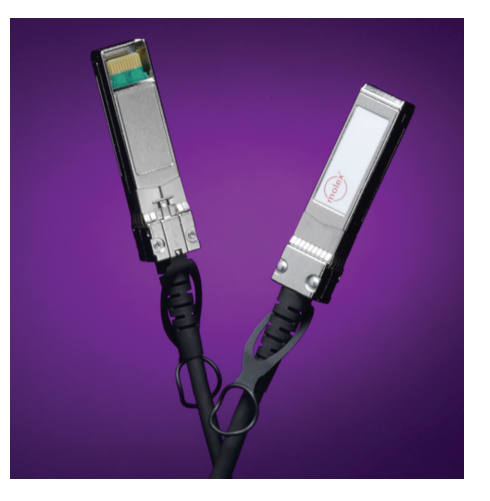
SFP+ Passive Cable Assembly, Series 74752