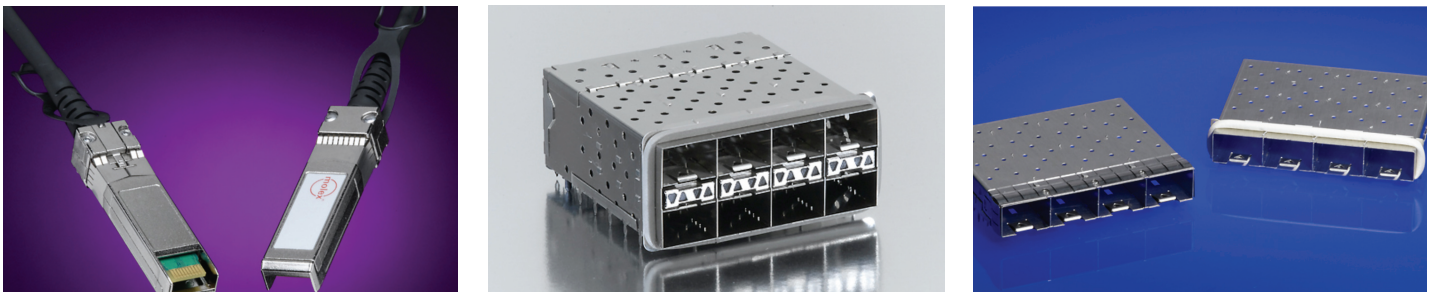
Patch Cables, Series 74752