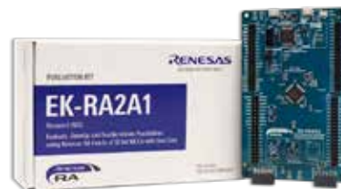
Evaluation Kit: EK-RA2A1