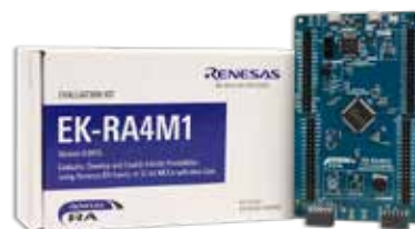
Evaluation Kit: EK-RA4M1