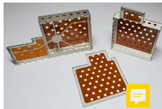
Kapton application solution defibrillator