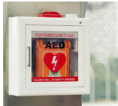
Wall mounted defibrillator