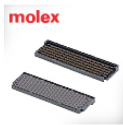
Molex Mirror mezz enhanced