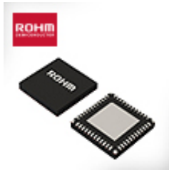
ROHM ROHM's latest Configurable PMIC