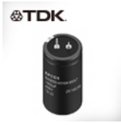
TDK Ultracompact snap-in aluminum electrolytic capacitors