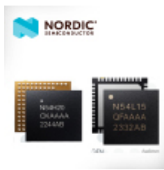
Nordic Machine Learning Artificial Intelligence