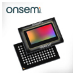
onsemi Image Sensors AR0823AT