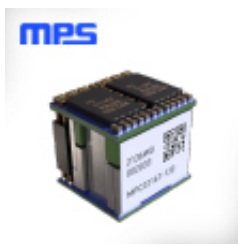
MPS 130A Two-Phase Intelli-Module™ MPC22167-130