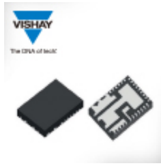
Vishay SiC45x family microBUCK® synchronous buck regulators