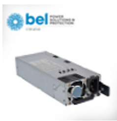
Belfuse Front end power supply

Avnet together with the leading suppliers bring you the best AI-TRiSM products.