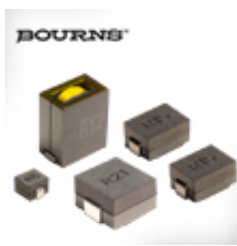
Bourns SPB family Power bead inductor