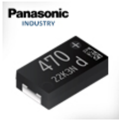
Panasonic KX series