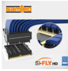
Samtec SI-FLY™ HD on-package