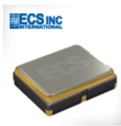
ECS ECS-TXO-2520MV series