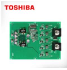
Toshiba DCDC Cconverter for data server system