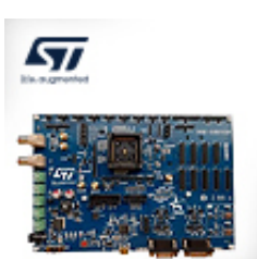
STMicroelectronics SR5E1Exxx MCU