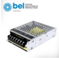
Belfuse Power supply for charging station