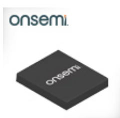
onsemi efuse NIV3071