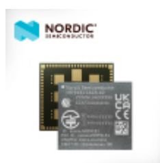
Nordic nRF9160 SiP, nRF9161 SiP, nRF9151 SiP, nRF9131 mini SiP