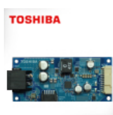
Toshiba buck-automotive DC-DC converter