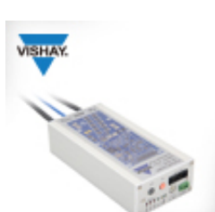
Vishay 48 V, 100 A eFuse