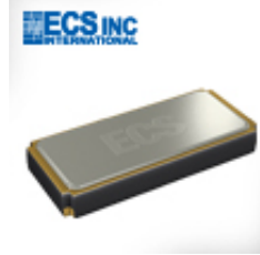
ECS 32.768 kHz Tuning fork crystal