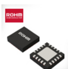
Rohm ROHM's latest DC/DC converter for automotive