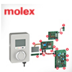
Molex EV charging infrastructure