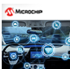
Microchip Microchip FPGAs in automotive