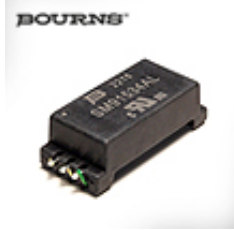
Bourns SM91534AL series high creepage transformer