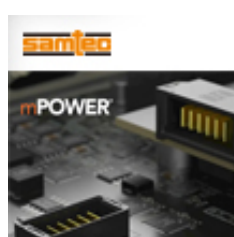
Samtec mPOWER@ 2.00 mm pitch ultra micro power system