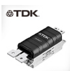
TDK Key components in EV