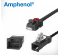
Amphenol Mini HSBridge+

Avnet together with the leading suppliers bring you the best EV infrastructure products.