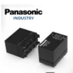
Panasonic HE-R relay