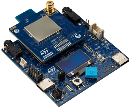
STM32WBA65I-DK1 global view. Picture is not contractual.