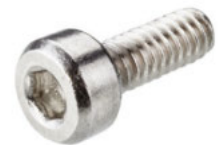
M80-2270000B 5mm Hex Socket Board Mount Bolt