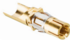
M80-PF5 Female 40A, 10 AWG Solder Contact