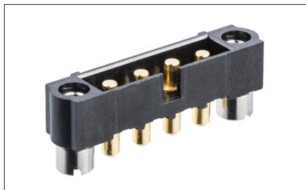
40A male vertical PCB connector with board mount jackscrews

These lightweight connectors are ideal where COTS (Commercial Off-The-Shelf) substitution is possible. Guard against vibration and shock with fitted stainless steel jackscrews. These robust connectors bring you a proven track record under extreme conditions. Choose these stocked options for no leadtime, fully inspected for quality assurance.