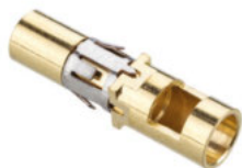
M80-325 Female 20A, 12 AWG Solder Contact