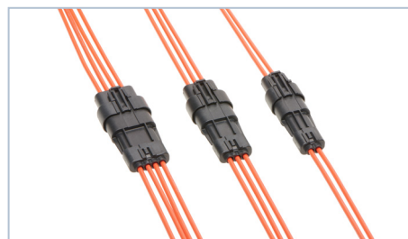
Squba 3.60mm-Pitch Sealed Connector Family, Fully Mated, 2 to 4 Circuits, with a Current of up to 14.0A