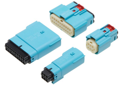
MX150 Sealed Connector System

The MX150 Sealed Connector System is a field-proven solution that delivers highly reliable performance under extreme temperatures, varying degrees of vibration, and exposure to moisture and chemicals for a variety of applications.