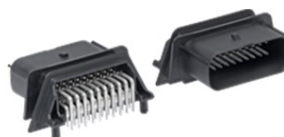
R/A Headers and Unshrouded Headers Available