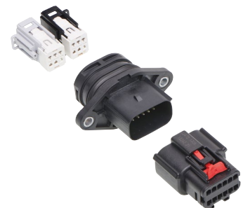
MX150 Pass-Through Connectors for Oil-Cooled Motor Connections