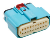
MX150 Mid-Voltage Connectors Capable of up to 60V