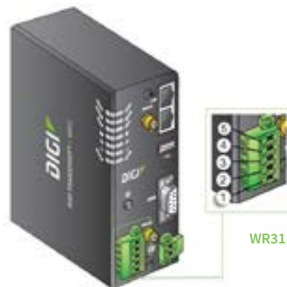
WR31 P/N: WR31-M52A-DE1-TB

Many Digi customers have highly demanding applications operating in extreme conditions such as mining and oil and gas, which are subject to a range of environmental conditions. The following are two such examples.